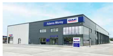
Bridgwater, United Kingdom