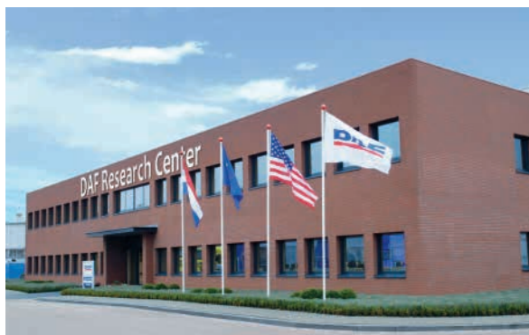
The Eindhoven based Engine Test Center is instrumental in expanding PACCAR's leading position in engine development.

On the road to an even cleaner future, DAF is offering a series of battery electric XB, XD and XF vehicles. Hydrogen technology is researched as a promising powertrain solution for the longer term. In addition, DAF is also further developing the highly efficient, clean diesel engines.