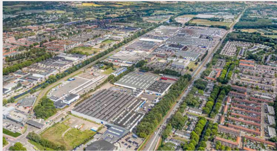
DAF's Eindhoven plant covers a total surface area of over 1,000,000 square meters.