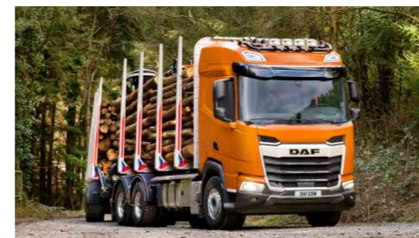
DAF Brasil produced over 6,500 vehicles in 2025 and achieved a strong 8.6 percent market share in the 16+ tonne segment. DAF Brasil expanded South American exports by delivering trucks to Peru and Suriname.

DAF Brasil produced over 6,500 vehicles in 2025, including the 50,000 th truck assembled at the Ponta Grossa plant. DAF Brasil achieved 8.6 percent market share in the 16+ tonne segment and expanded South