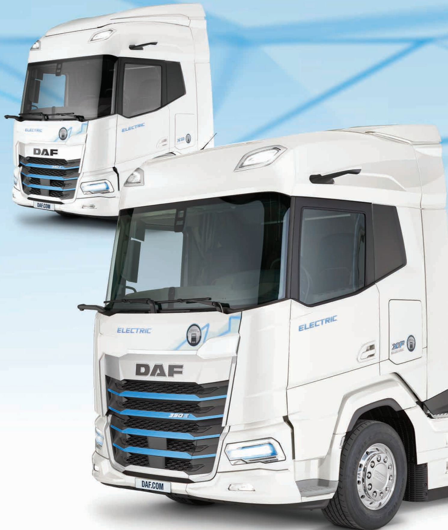
Designed for urban and regional settings, the award-winning DAF XD and XF Electric offer zero emission driving ranges up to 500 kilometers and can be charged in less than two hours. The XD and XF Electric provide superior quality, operating efficiency and state-of-the-art technology and can be optimally tailored to customer needs.