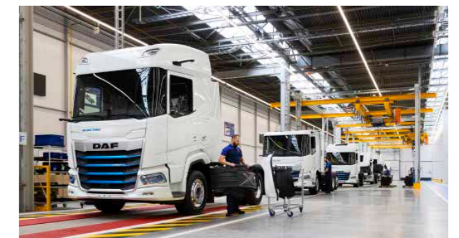
DAF opened an entirely new, advanced electric truck assembly plant in Eindhoven for the production of the new DAF XD, XF, XG and XG+ Electric trucks, featuring state-of-the-art PACCAR e-motors and a choice of modular battery packs.