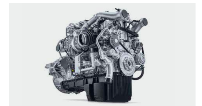
At the leading BusWorld exhibition in Brussels, Belgium, updated PACCAR MX-11 and MX-13 engines were launched for buses and coaches, featuring a suite of innovations to enhance efficiency.

It is estimated that industry sales in the above 16-tonne truck market in Europe in 2026 will be in a range of 280,000-320,000 units. With a class-leading product range, top quality services and a strong dealer network, DAF is well positioned to further increase market share in the coming years.