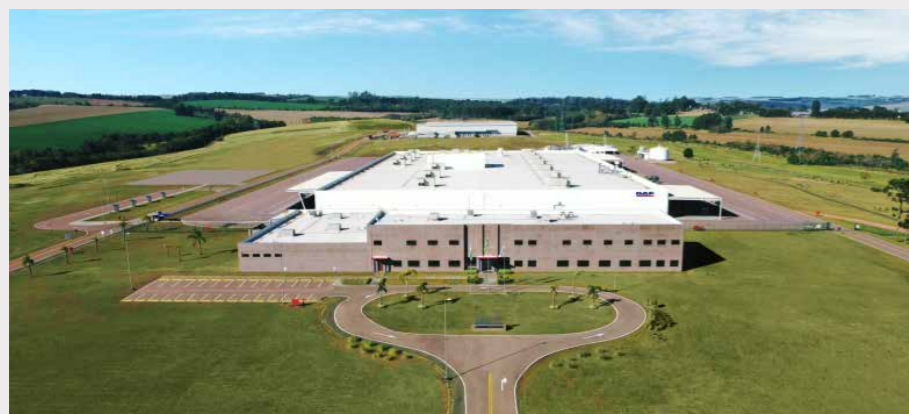
The 28,000 square metres facility in Ponta Grossa produces CF and XF vehicles for Brasil, as well as other South-American countries.

DAF products are manufactured in Eindhoven (the Netherlands), Westerlo (Belgium), Leyland (UK), Ponta Grossa (Brasil), Bayswater (Australia) and Taichung (Taiwan).